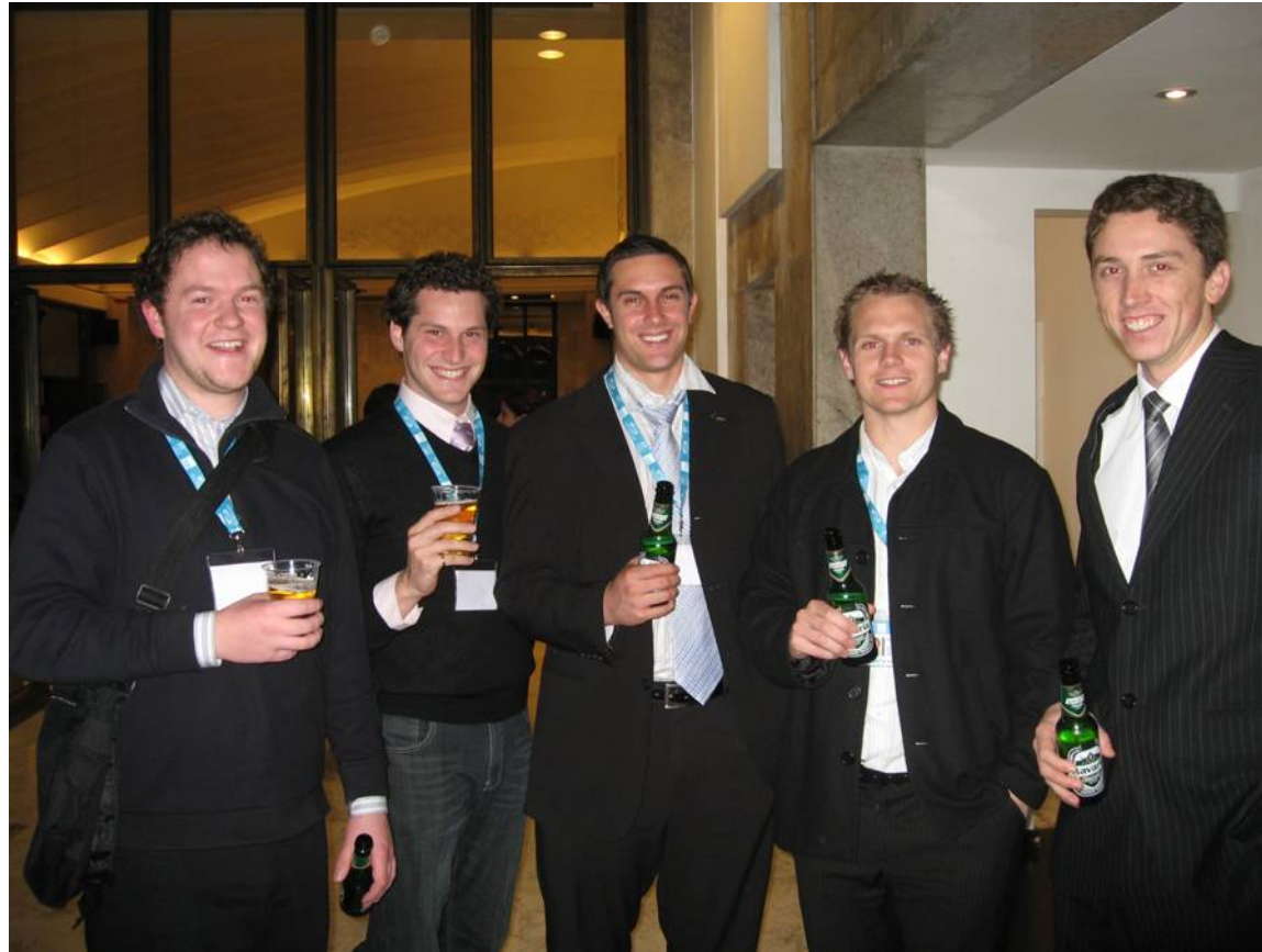
New Zealand Youth Delegates - WEC Rome 2007