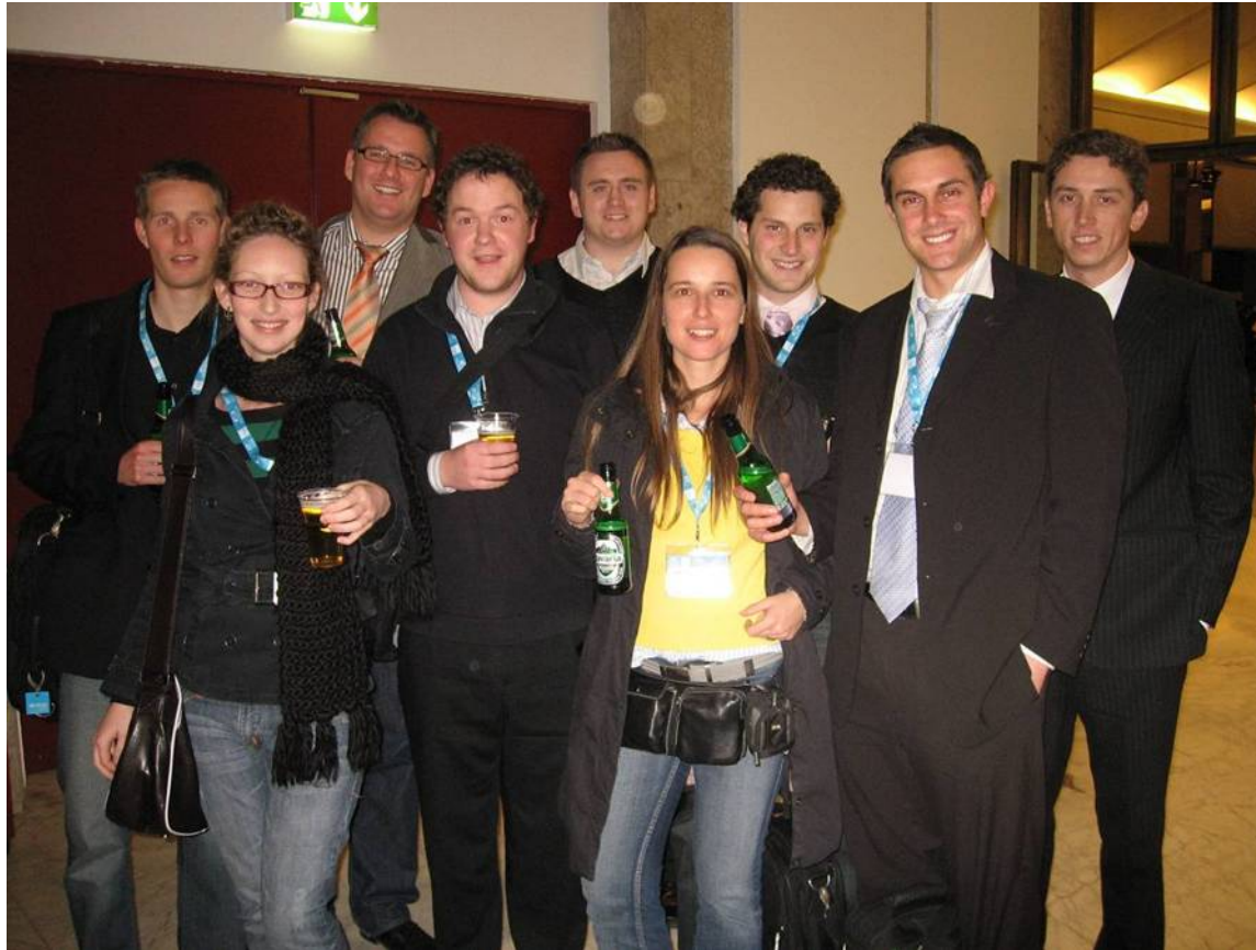
New Zealand Youth Delegates - WEC Rome 2007